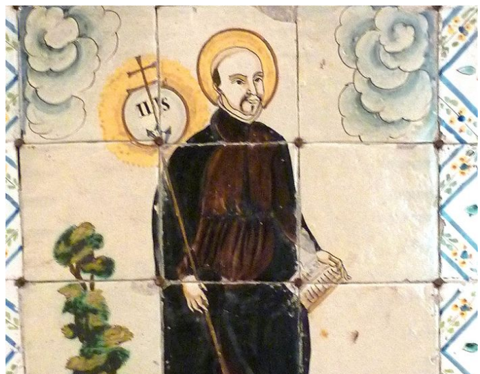
The Lord's Prayer