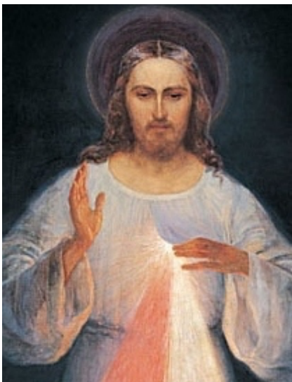
Jesu, I trust in You

A Period of Silence in which we pray with St Ignatius seeking understanding and insight.