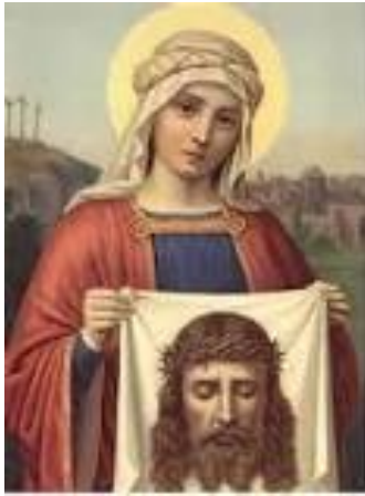
St. Veronica, model of reparation to The Holy Face

"Behold, O God, our protector, and look upon the Face of Thy Christ!"