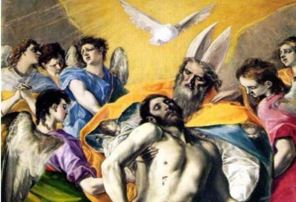
The Holy Trinity

Visual contemplation of this representation of The Holy Trinity enables us with creative imagination to silently absorb the Mystery of The Trinity- a useful preparation for the reflection on Ignatius & The Holy Trinity.