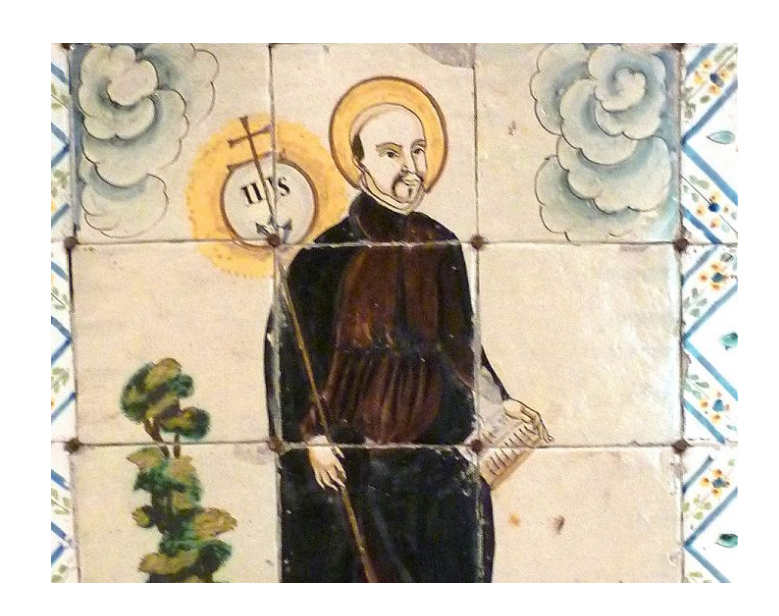
Jesu, I trust in You