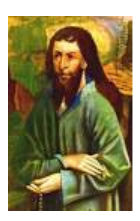
WE recall his holy Life and reflect on the Meditation Prayer Cloth